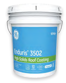
GE Enduris seamless 100% silicone coating can restore and extend roof life expectancy with one-coat application.