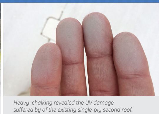
Heavy chalking revealed the UV damage suffered by the existing single-ply second roof.