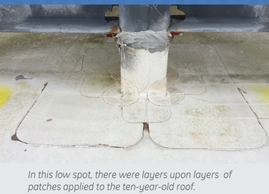
In this low spot, there were layers upon layers of patches applied to the ten-year-old roof.